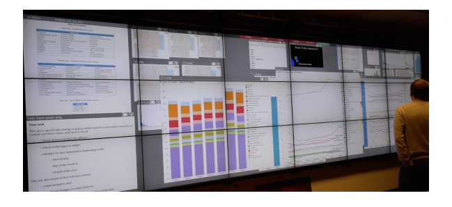
Figure 1: A subject examining crime data.

Subjects were instructed to ask spoken questions directly to the DAE (they knew the DAE was human, but couldn't make direct contact<sup>4</sup>). Users viewed visualizations and limited communications from the DAE on a large, tiled-display wall. This environment allowed analysis across many different types of visualizations (heat maps, charts, line graphs) at once (see Figure 1).